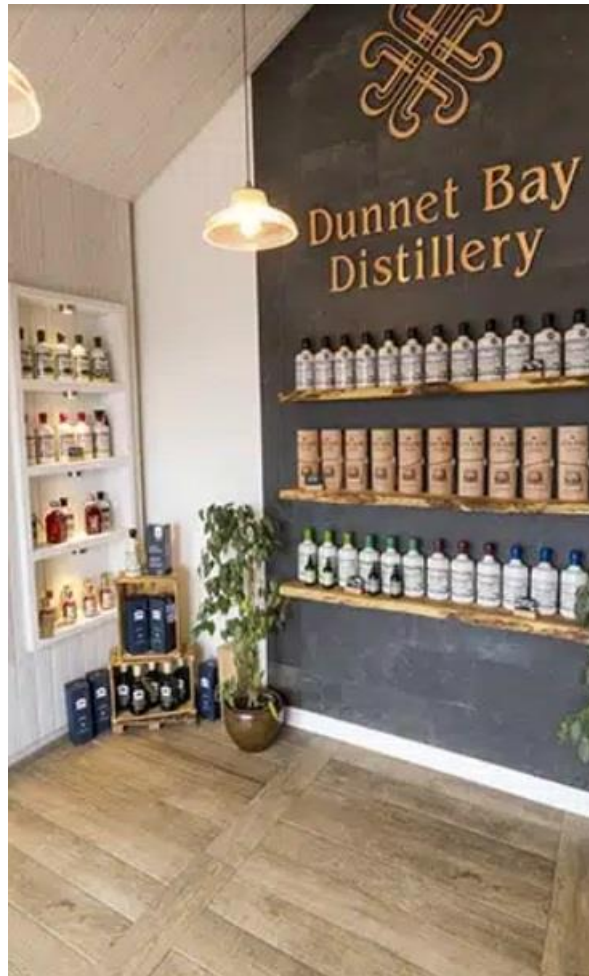
Shop merchandise displays.