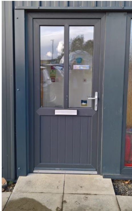
Entrance door to the Main Distillery Building.