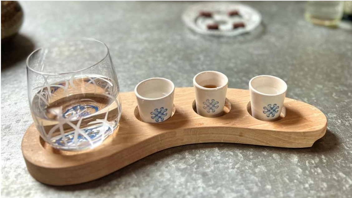
Tasting table laid for a tutored tasting session.