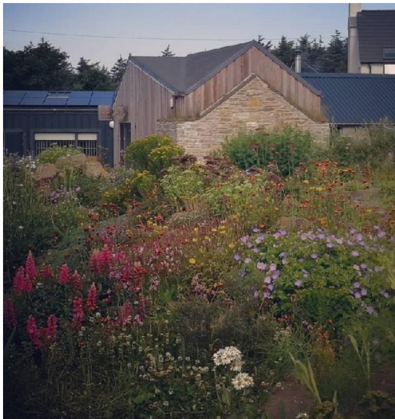
Distillery Herb Garden.