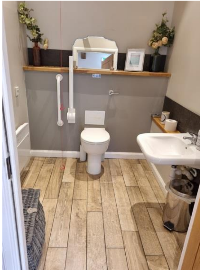
Unisex accessible toilet in the Tasting Room.