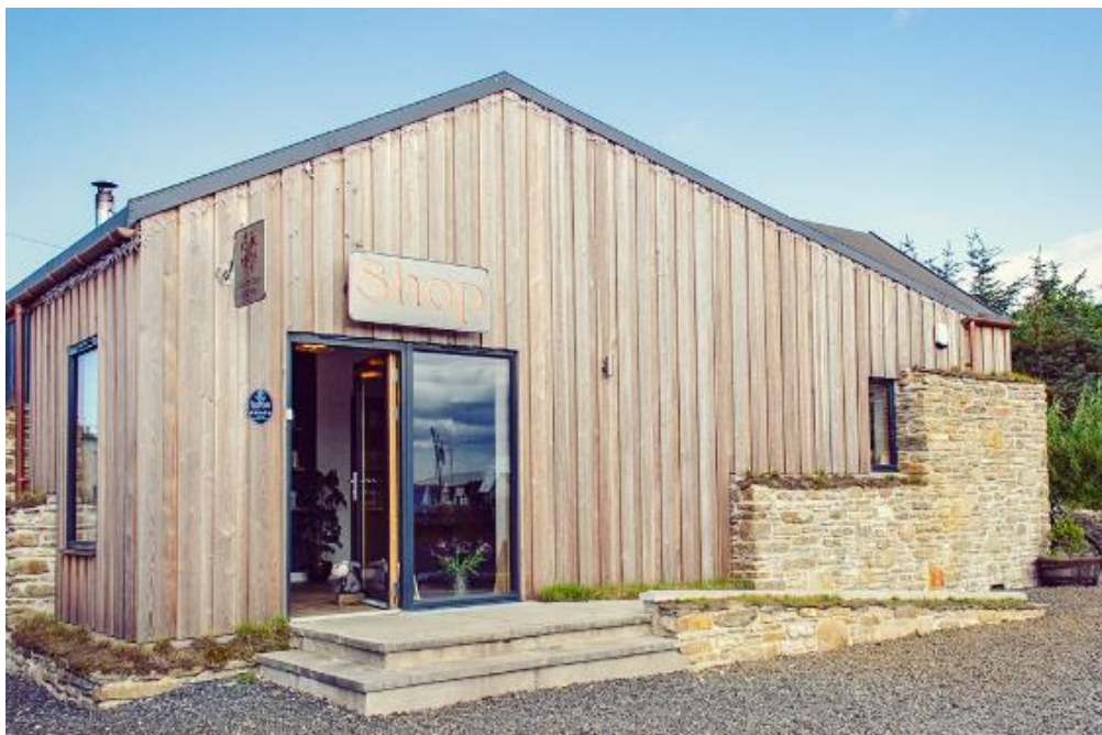
Distillery car park and main entrance to the Visitor Centre.