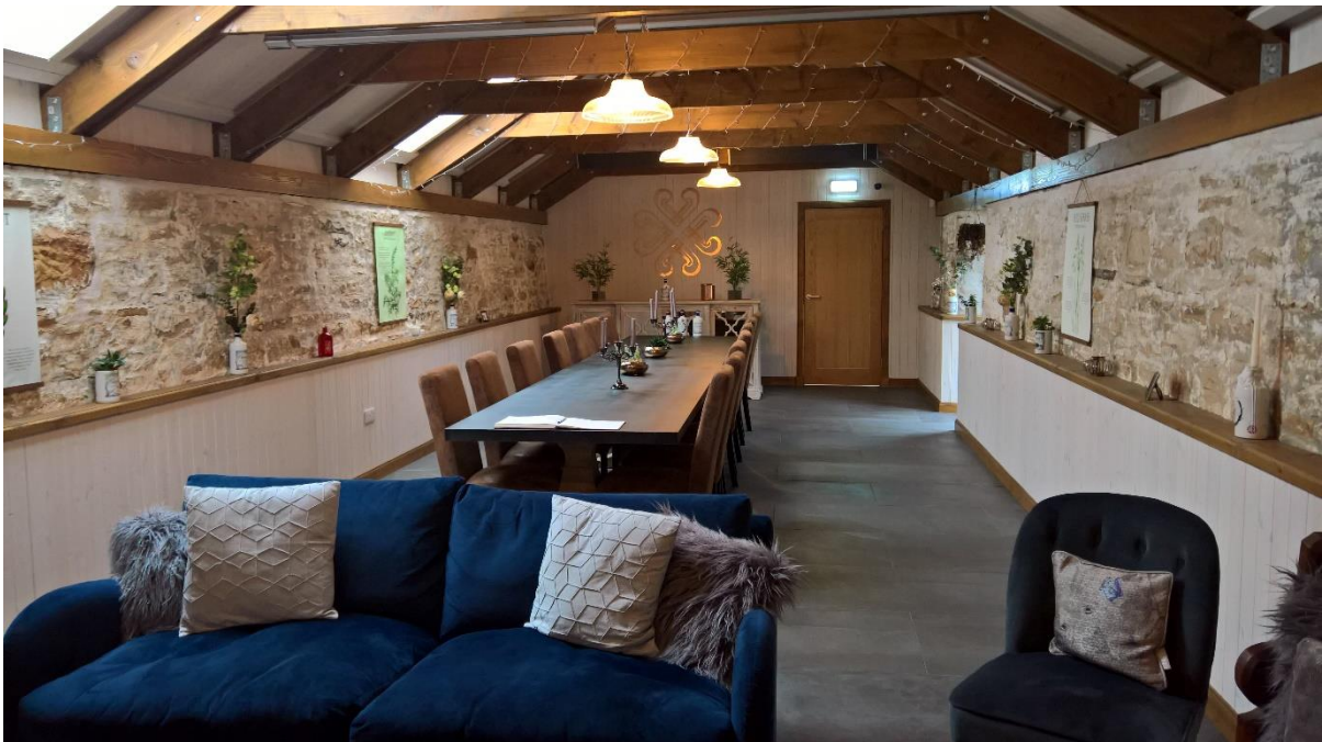
Seating area and tasting table in the Tasting Room.