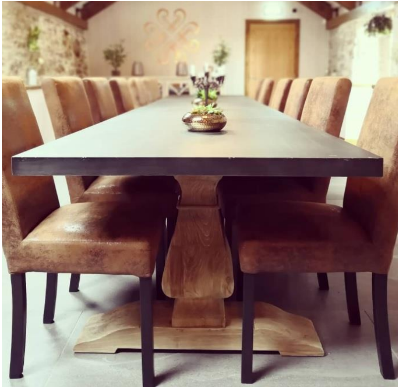
Tasting table in the Tasting Room.