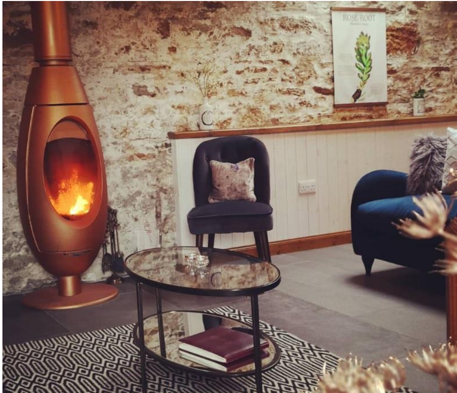
Seating area in the Tasting Room.