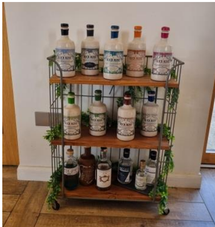
Spirit Tasting Station.