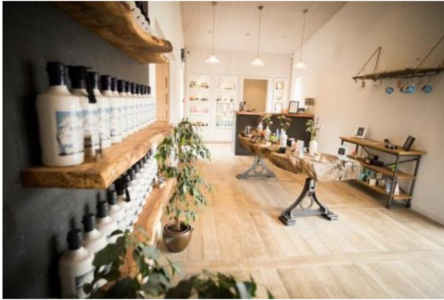
Interior of the Shop located in the Visitor Centre.