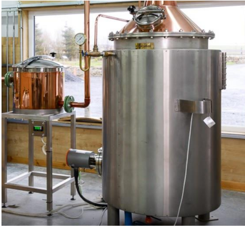
The Still House.