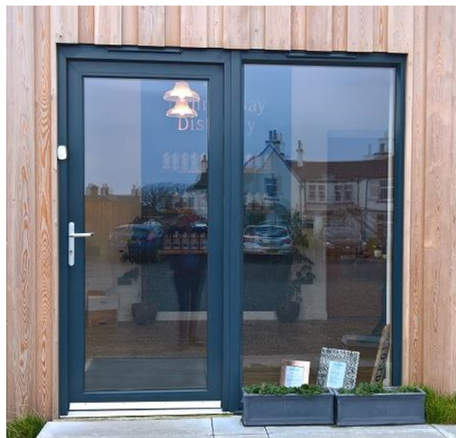
External main entrance door to the Visitor Centre.