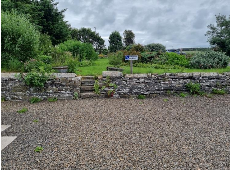
Parking space for Blue Badge holders.