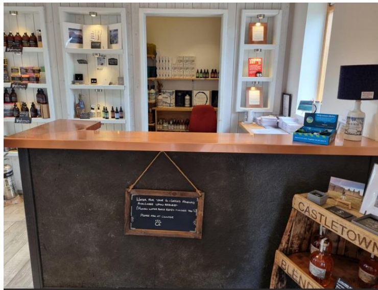
Shop Counter and Visitor Reception/Tour Check-In Area.