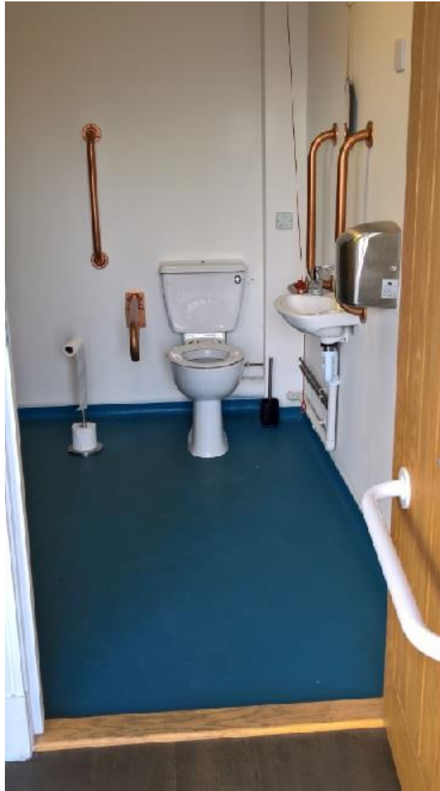
Unisex accessible toilet in the Main Distillery Building.