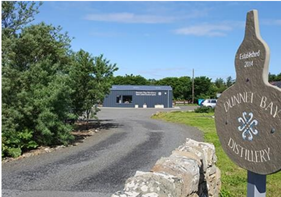
Drive leading to Dunnet Bay Distillery.